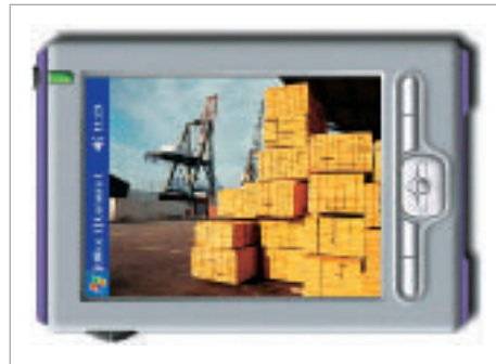
View in full screen landscape mode