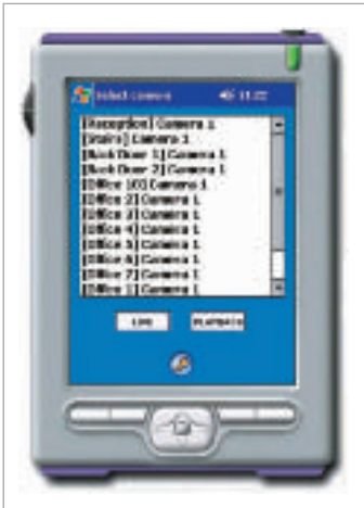
Select a camera

With Milestone XProtect PDA Client, you simply select which camera to connect with, and view live or recorded images – from anywhere!