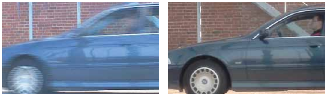
At left, a full-sized JPEG image (704x576 pixels) from an analog camera using interlaced scanning. At right, a full-sized JPEG image (640x480 pixels) from an Axis network camera using progressive scan technology. Both cameras used the same type of lens and the speed of the car was the same at 20 km/h (15 mph). The background is clear in both images. However, the driver is clearly visible only in the image using progressive scan technology.

In a surveillance application, this can be critical for viewing details within a moving image such as a person running or a vehicle moving. Another benefit of this technique is that single frames can be used to make paper copies with almost photographic quality. This can be crucial if the material is, for instance, to be used as evidence in a court of law. Of course, these potential gains must be weighed against progressive scanning's requirement for somewhat more bandwidth.